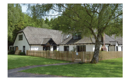
where you will learn and play and make lots of friends.